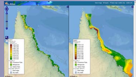
Dugong numbers with sea grass abundance